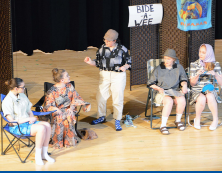
Grade 10 Drama Performance Exam