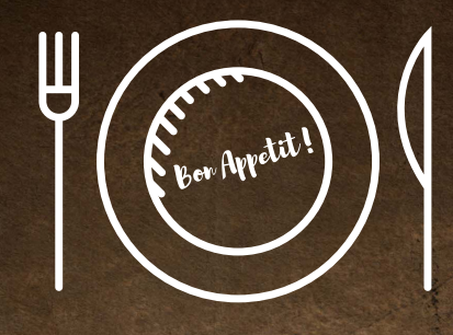
Table For One Hundred

Purchase tickets at smamb.ca/events/marian-awards-for-excellence For more information, contact Kerri Moore at kmoore@smamb.ca or 204-478-6031