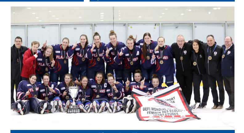
Flames Prep Team Female World Sport School Challenge Champions