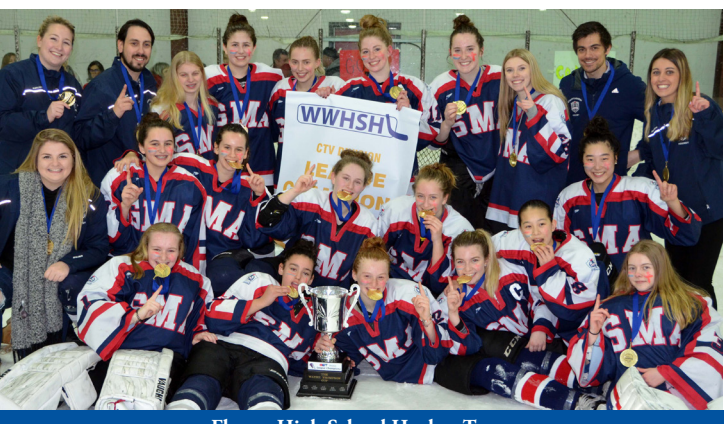
Flames High School Hockey Team Winnipeg Women's High School Hockey League, CTV Division Champions